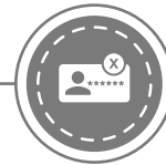
Personal Data Breaches