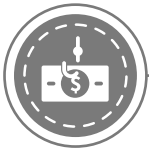
Phishing / Spoofing